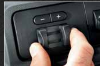
FACTORY-INTEGRATED TRAILER BRAKE CONTROLLER OPTION

AdvanceTrac® with class-exclusive RSC® (Roll Stability Control) 4 is standard on all E-Series Vans and Wagons this year. Working in conjunction with the Anti-Lock Brake System (ABS), traction control and yaw control, the system automatically determines when and how to apply individual brakes and modify engine power to help keep all 4 wheels firmly planted.